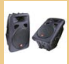
JBL EON PRO SYSTEM

Q: IS IT OK TO SEND YOU A COPY OF MY MONTAGE TO CHECK OUT BEFOREHAND?